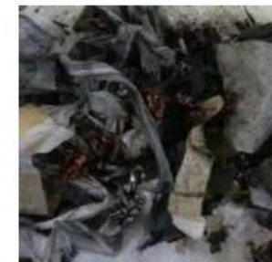
(b) Plastic and paper